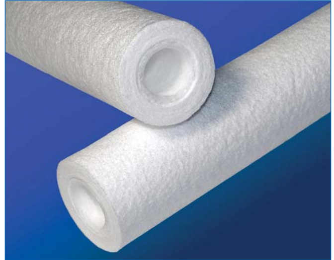
Claris Filter Cartridges