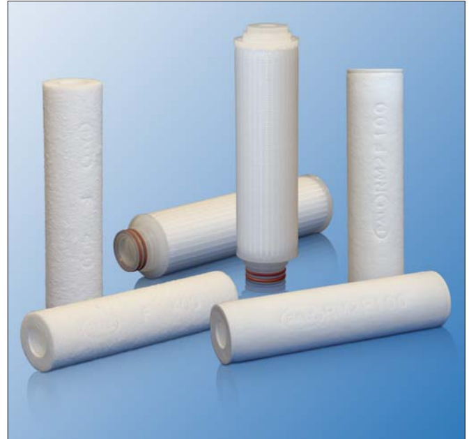
Profile II filter cartridges available in AB, RF and RMF styles

Please refer to the Pall website www.pall.com/foodandbev for a Declaration of Compliance to specific National Legislation and/or Regional Regulatory requirements for food contact use.