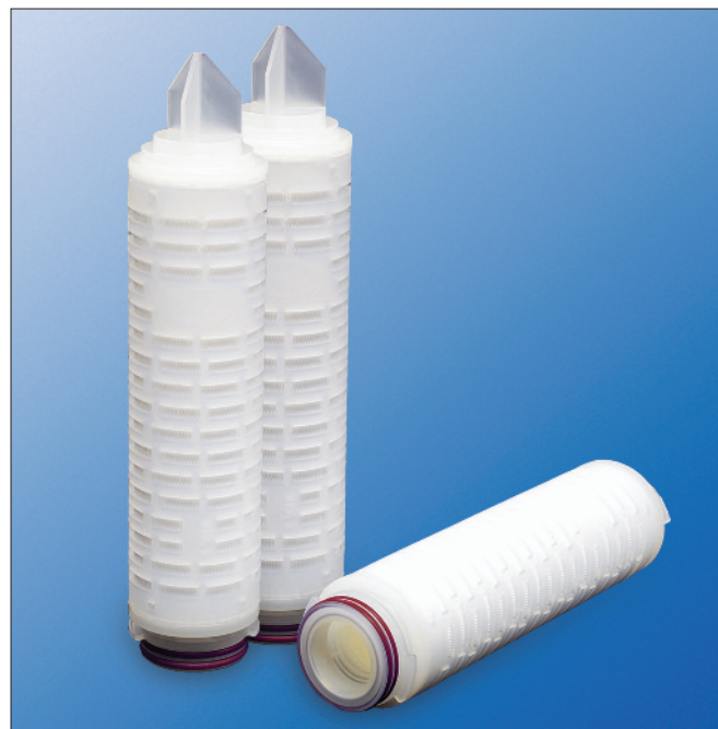
MEMBRACart XL II filter element

In order to ensure traceability each filter element is marked on the cage with ordering code and batch number. In addition, every filter cartridge bears an individual number. Product name, removal rating, ordering code and batch number are indicated on the packing label.